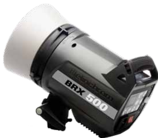
BRX 500 — 500Ws — N° 20441.1