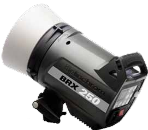
BRX 250 — 250Ws — N° 20440.1

Accessory bayonet accepting the complete range of light modifiers.