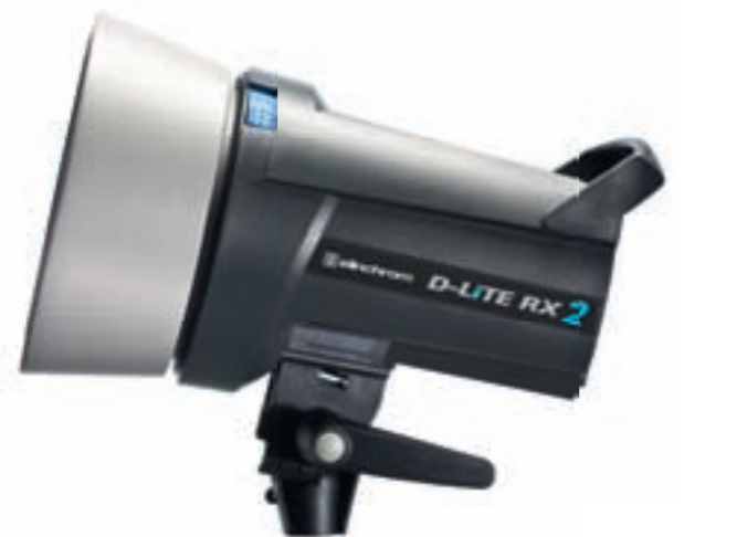
D-Lite RX 2 — 200Ws — N° 20486.1

Accessory bayonet with speed locking, accepting all EL-accessories and Rotalux softboxes up to 135 cm.