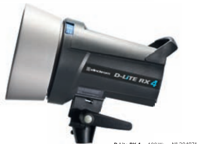
D-Lite RX 4 — 400Ws — N° 20487.1